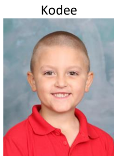
Tuesday 17 th July